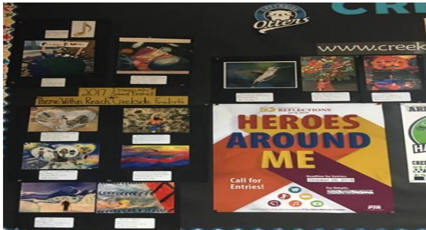
12- 2017 Creekside finalists on the PTA bulletin board.